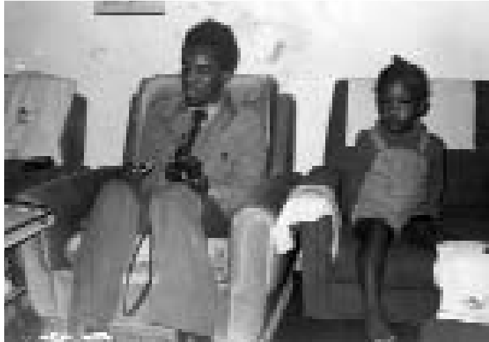
3 years old with uncle