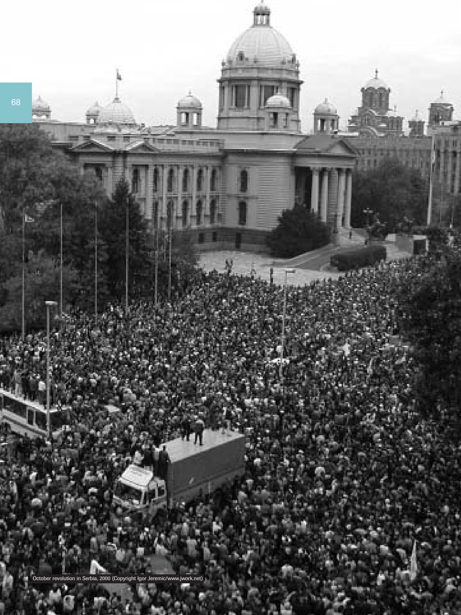
October revolution in Serbia, 2000