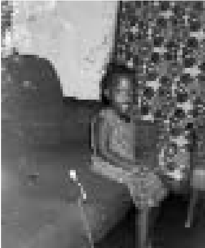
4 years old in Lilongwe