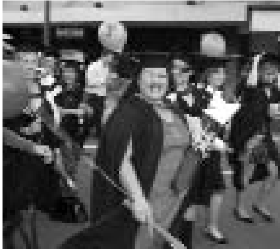
Eldest daughter graduating with a Bachelor degree in Anthropology, Massey University.