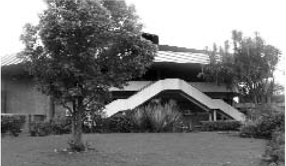
Chancellor College, Malawi

in developed countries. In order to promote Internet connectivity for the tertiary education and research sectors, the Malawi Research and Education Network (MAREN) was established in October 2005. I joined MAREN in 2006 soon after my return from Australia and I am part of a task force that oversees its operations. MAREN has successfully lobbied for the use of existing fibre owned by the Electricity Supply Commission of Malawi (ESCOM). This is strategic because the main fibre line runs close to most tertiary education and research institutions. MAREN is now seeking financial, technical, and material assistance to connect institutions that are not close to this main fibre line. The options explored at the moment are fibre and wireless connection.