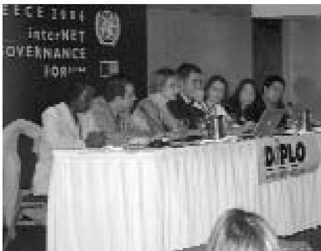
Diplo workshop in IGF Athens, 2006