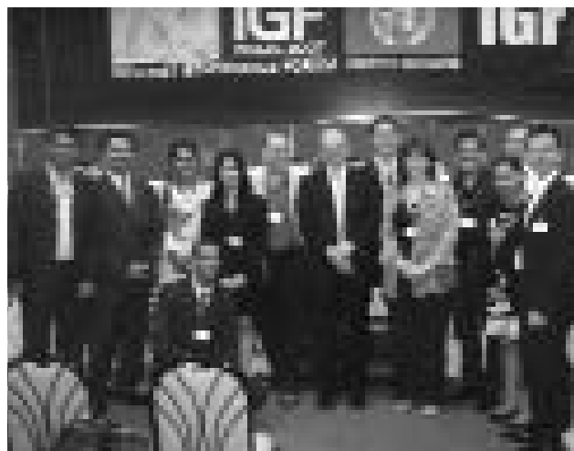
Discussion session with Bob Kahn at IGF Rio