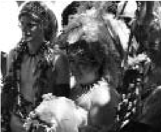
Eldest daughter getting married the traditional way.