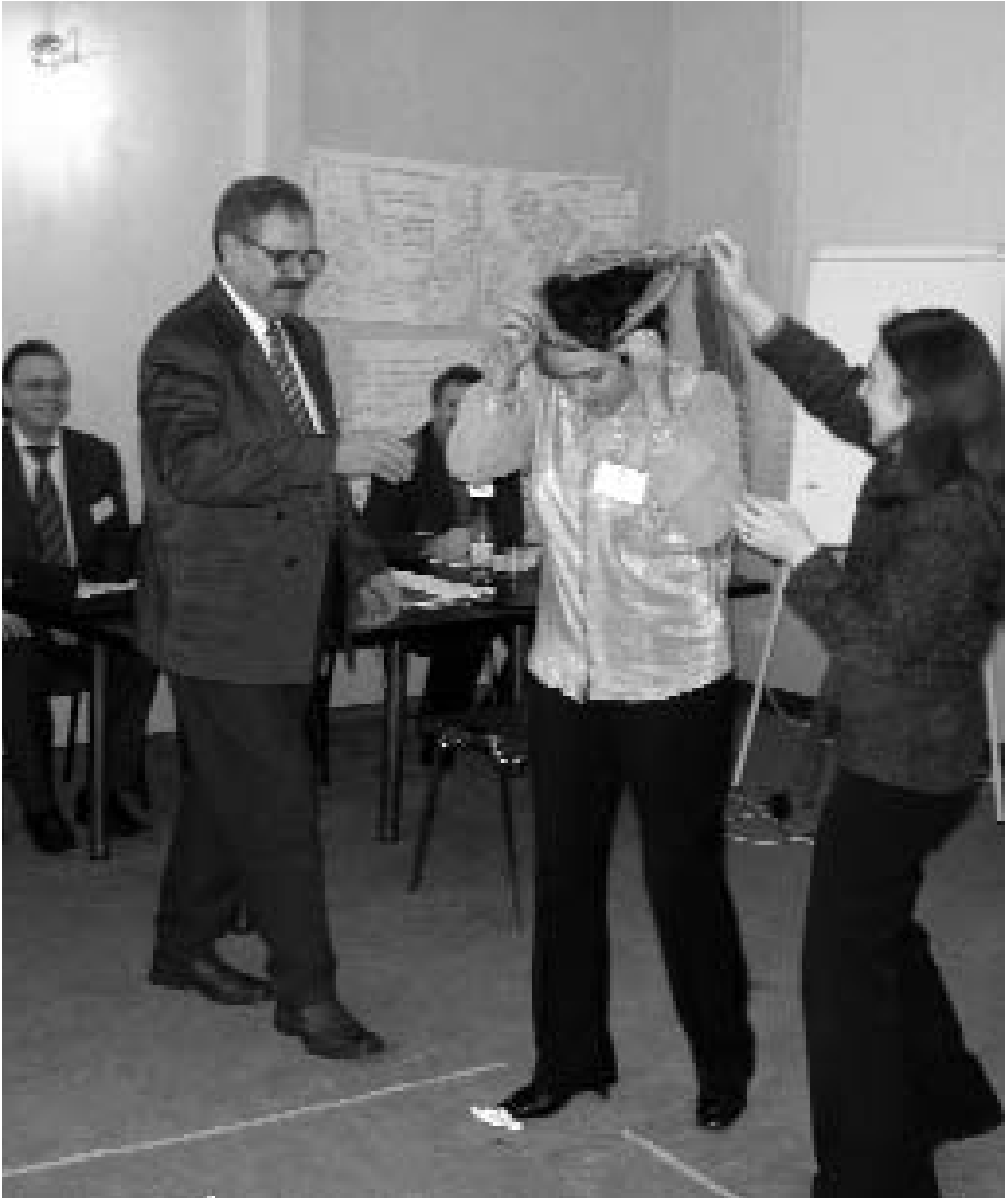
Training Program organized for Trade Union representatives on HIV/AIDS policies at the work place held in March 2007. The photo captures a session focusing on the multistakeholder approach to policy development in this area. The game "Mine field" has several steps, but the key part is having several participants take turns to cross the field with eyes closed while being guided by someone else. While debriefing the game, the participants were asked "What can really help a person cross through this mine field?" Participants answered that proper guidance from someone who knows the situation and has experience would help, and that crossing the field with open eyes could help even more. Participants drew parallels to the multistakeholder approach to policy development and the importance of the 'guide' in the process.