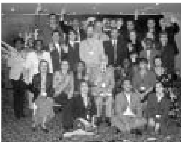
Discussion session with Vint Cerf in IGF Athens