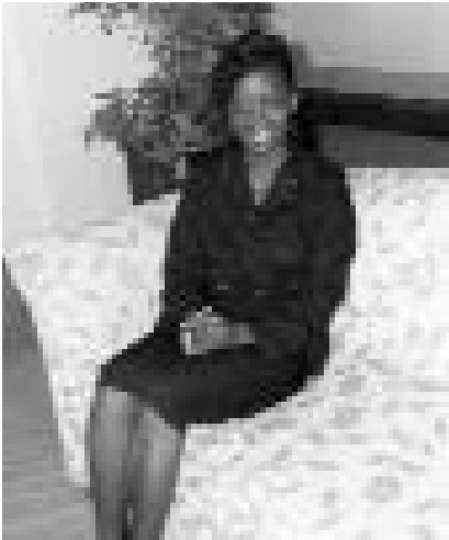
Final year student (BSc), Chancellor College