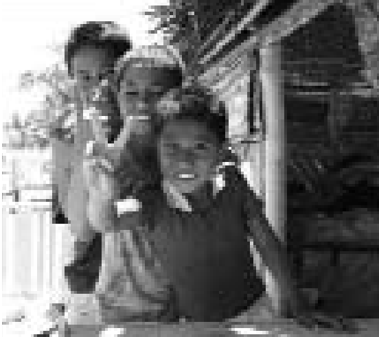
Fuatai's nieces and nephews on the deck of her beach fale in Falealupo.